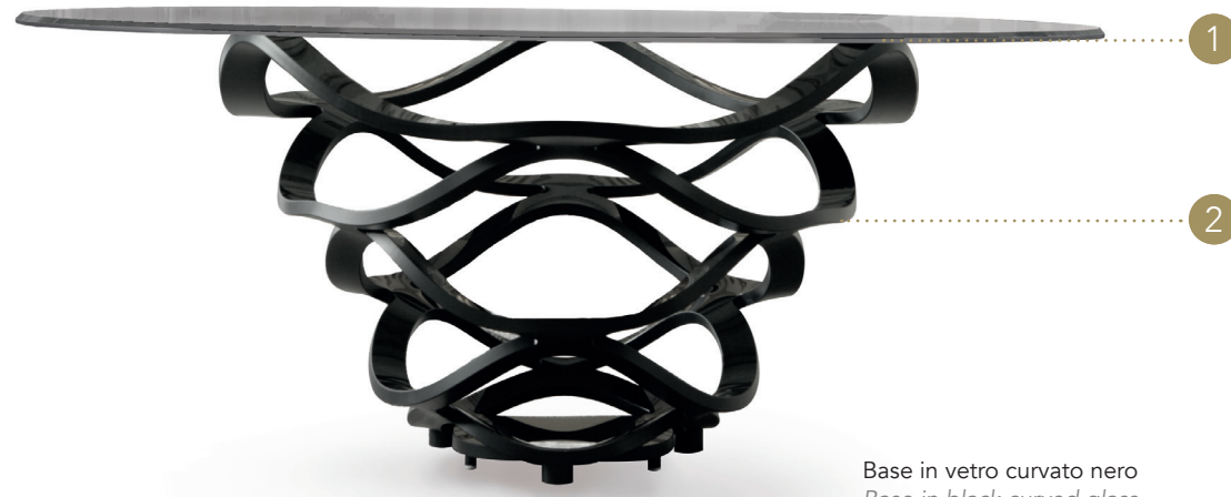
Base in vetro curvato nero Base in black curved glass